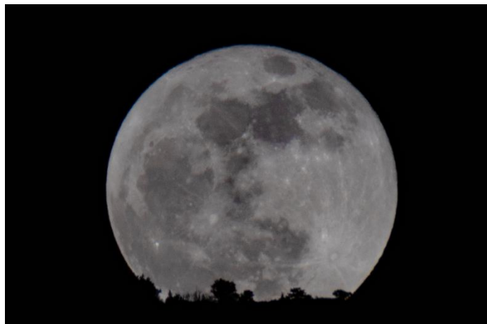
An image of the Full Moon rising on the winter solstice 2018.

( https://www.nasa.gov/feature/sending-american-astronauts-to-moon-in-2024-nasa-accepts-challenge ).